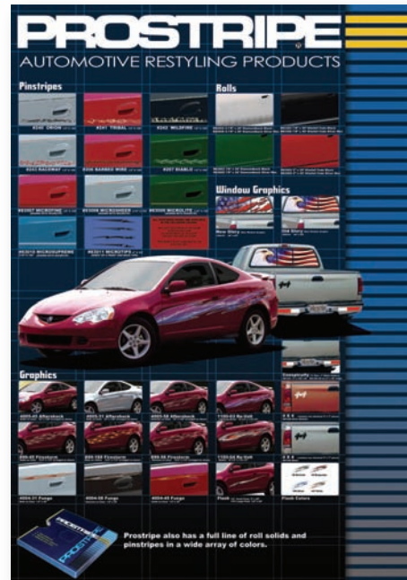
Z1355 Prostripe/Sharpline Poster