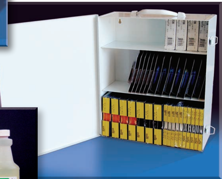
Z1027 Stripe Cabinet